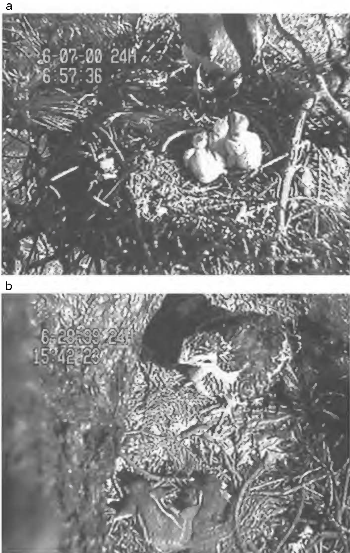
Figure 2. Images of Northern Goshawk nests taken from video footage in east-central Arizona: (a) Female goshawk feeding 5-d-old young. (b) Golden-mantled ground squirrel and plucked Stellar's Jay in the nest with 25–30 d old goshawk young.